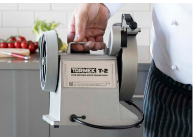
Sturdy handle which makes it easy for you to move the machine when needed.