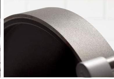
Fine-grained Diamond Wheel optimized to provide a high level of sharpness and at the same time an efficient steel removal, without removing more steel than necessary.