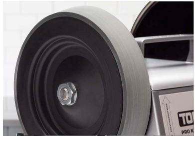
Specially developed composite wheel with integrated polish that removes the burr.